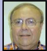
Vice-Mayor Karl Littman Precinct 4