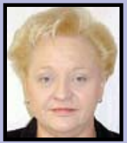
Mayor Caralee Mayer Precinct 1