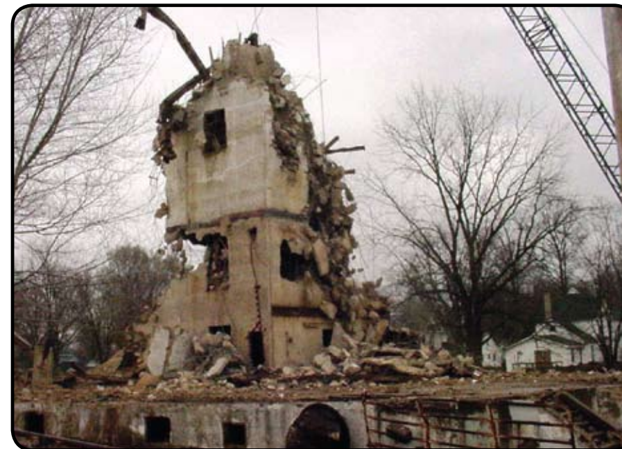
Demolition in progress at old granary on W. Congress

The City has also been working on some more long-range economic development efforts to facilitate future growth. July 10th the City unveils its Economic Development Strategic plan; you can read more about this in the Message from the City Manager. Also, this summer construction begins on the infrastructure for the Fawn River Crossing development area, a collaborative effort for development between the City and other local partners in Michigan and Indiana; this area is expected to see major growth in the coming years.