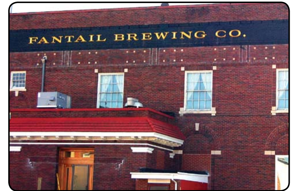
The Fantail Brewpub opened this year in the newly-refurbished Elks Building