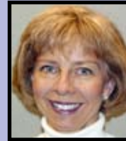
Commissioner Suzanne Walters Precinct 4