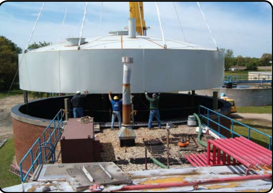
Workers help lower new digester cover into place

The 2007 SRF Project, the Wastewater department's major construction project this year, is nearly complete. Partially funded by State money, this year's construction involved replacement of the outflow pipe running from the Treatment Plant to the Fawn River, installation of new processing equipment at the plant, and the replacement of the cover of one of the digester tanks. As of June 1st, the majority of this work is complete.